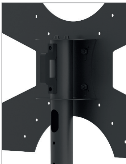
handle on the back of the column