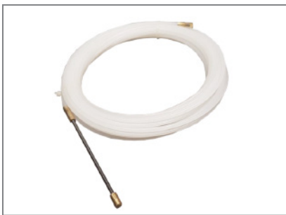
usefull cable pulling aid included