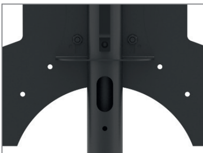
cable management inside the column