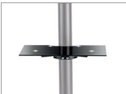
Optional: Braclabs Stand Front shelf (Item no.: 1984)